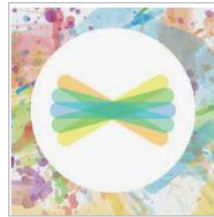
Seesaw OneApp (Goggle Play)

Parents/Carers can download the Seesaw Learning App (from the Apple App Store) for iOS or Seesaw OneApp (on Goggle Play) for Android however, most web browsers can be used to view student's learning artefacts.